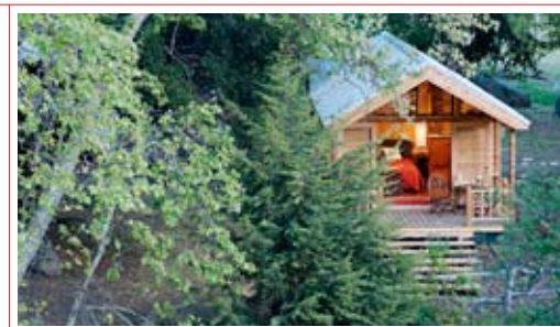
2. CAVCO CABINS CAVCO.COM