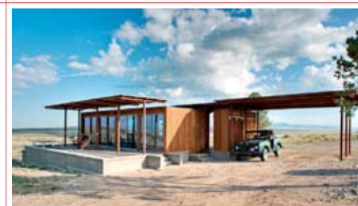
8. WEEHOUSE/ALCHEMY ARCHITECTS WEEHOUSE.COM