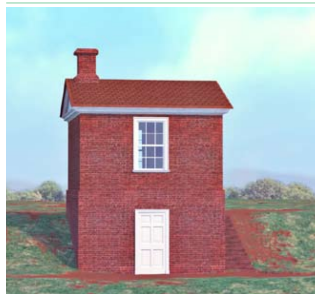
• A STILL SHOWING THE SOUTH PAVILION FROM THE ANIMATED VIDEO PUTTING UP AND PULLING DOWN AT THE MONTICELLO VISITOR CENTER

← “I HAVE HERE BUT ONE ROOM, WHICH LIKE THE COBBLER'S, SERVES ME FOR PARLOR AND FOR KITCHEN AND HALL. I MAY ADD, FOR BED CHAMBER AND STUDY, TOO.”