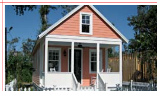
15. CUSATO COTTAGES CUSATOCOTTAGES.COM

FOR MORE DETAILS, SEE HOUSEBEAUTIFUL.COM/RESOURCES