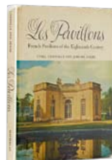
LES PAVILLONS (1962), A COLLECTIBLE BOOK ON 18TH-CENTURY FRENCH PAVILLIONS BY CYRIL CONNOLLY & JEROME ZERBE