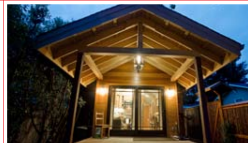
6. CLEVERHOMES CLEVERHOMES.NET