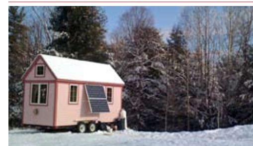
7. YES WEE CABINS YESWEECABINS.COM