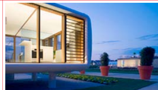
5. LOFTCUBE LOFTCUBE.NET