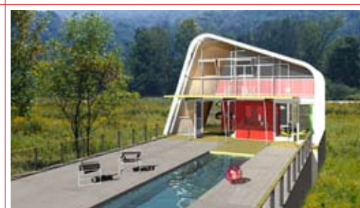
12. Q-HOUSE Q-HOUSE.ORG