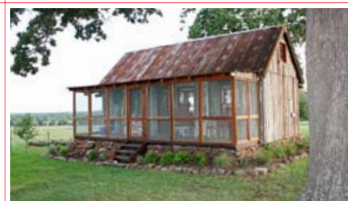
9. TINY TEXAS HOUSES TINYTEXASHOUSES.COM