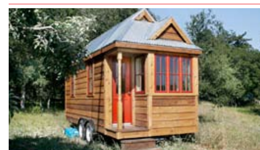
13. TUMBLEWEED TINY HOUSE COMPANY TUMBLEWEEDHOUSES.COM