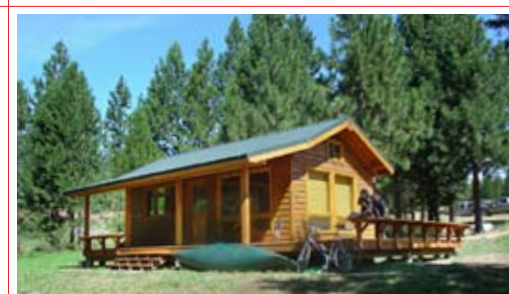
11. SHERPA CABINS SHERPACABINS.COM