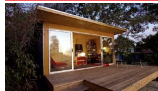
4. JOT HOUSE JOTHOUSE.COM