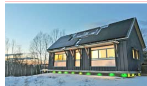
1. BRIGHTBUILT BARN BRIGHTBUILTBARN.COM