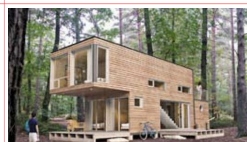
14. MEKA MEKAWORLD.COM