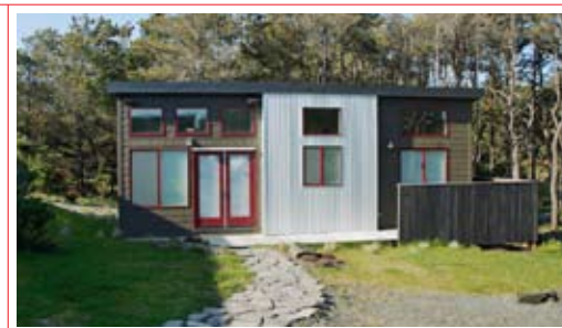
3. IDEABOX IDEABOX.US