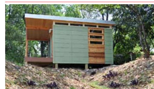
10. KANGA ROOM SYSTEMS KANGAROOSYSTEMS.COM